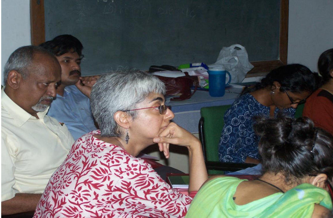
(iv) A section of the participants