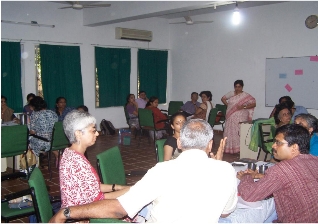
(II) Group discussions in progress