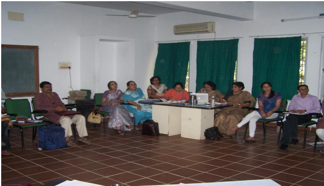
(iii) A section of the participants