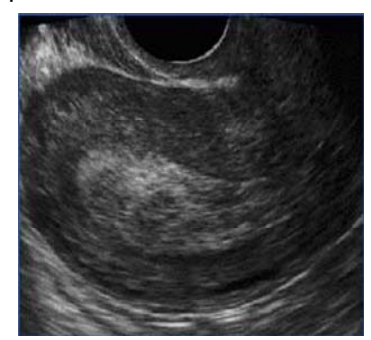
Absence of gestational sac and the presence of intrauterine debris are typical of a complete abortion.