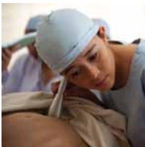
A trainee midwife in Afghanistan.

Training is a key issue. In the UK if you want to be a midwife, you can first train as a nurse and then do an additional year and a half in midwifery, or you can train directly as a midwife. In many countries in the developing world with acute shortages of midwives, the direct entry choice does not exist. This means training takes longer and midwives who are also qualified nurses can be diverted to perform other tasks. If someone is trained solely as a midwife, all their work is focused on the mother and her baby. Allowing midwives to train directly can be viewed as a more efficient use of training budgets.