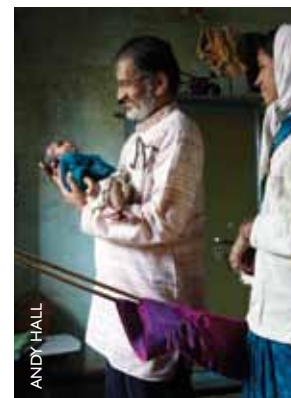
Dr Abhay Bang holds a newborn baby in a village in Maharashtra, India

While a qualified, fully equipped midwife at every birth is the ideal, when they are not available the option of supporting and providing basic training to traditional birth attendants and community health workers so they can spot danger signs and refer women to health facilities can make a significant difference. 20